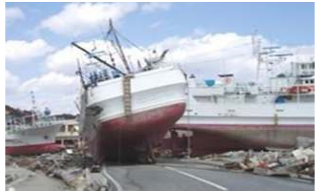
Ships Damaged by Tsunami in Great East Japan Earthquake